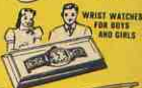
WRIST WATCHES FOR BOYS AND GIRLS

We will send you the wonderful prizes pictured on this page . . . or dozens of others, such as jewelry, radium dial wrist watches, tableware, tools, U-Make-It kits, leather kits, sewing kits, electric clocks, pressure cookers, scout equipment, model airplanes, movie machines, record players, and many others . . . all WITHOUT ONE PENNY OF COST. You don't risk or invest a cent—we send you everything you need ON TRUST. Here's how easy it is: Merely show your friends and neighbors inspiring, beautiful Religious Wall Motto plaques. Many buy six or even more to hang in every room. An amazing value, only 95¢ . . . sell on sight. You can secure big, cash commissions or many exciting prizes for selling just one set of 24 Mottos. Write today for Big Prize catalog sent to you FREE!